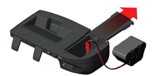
Optional #3037 Traxxas NiMH battery installation

The Docking Base incorporates a standard charging jack for use with optional Traxxas rechargeable NiMH battery pack (#3037) and wall charger (#6545)(each sold separately). Note: The charger and charging jack will not charge rechargeable AA batteries installed in the standard 4-cell AA battery holder supplied with the TQi. Only use the charger and charging jack with the #3037 Traxxas NiMH battery.